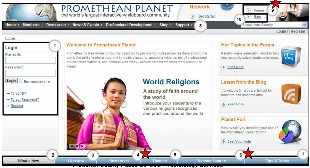
Promethean Planet Resources – Page 1