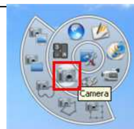
Camera using Desktop Tools

Point to Point Snapshot – Click and drag, drawing straight lines to enclose a highlighted outline area on the grayed-out screen. The area cannot be moved or modified. If you need to change it, just close the Camera Snapshot box and try again.